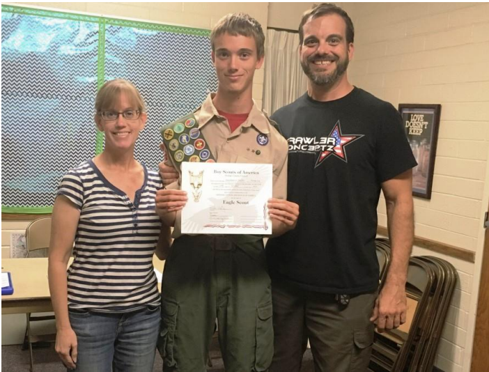
New Eagle with Proud Parents!